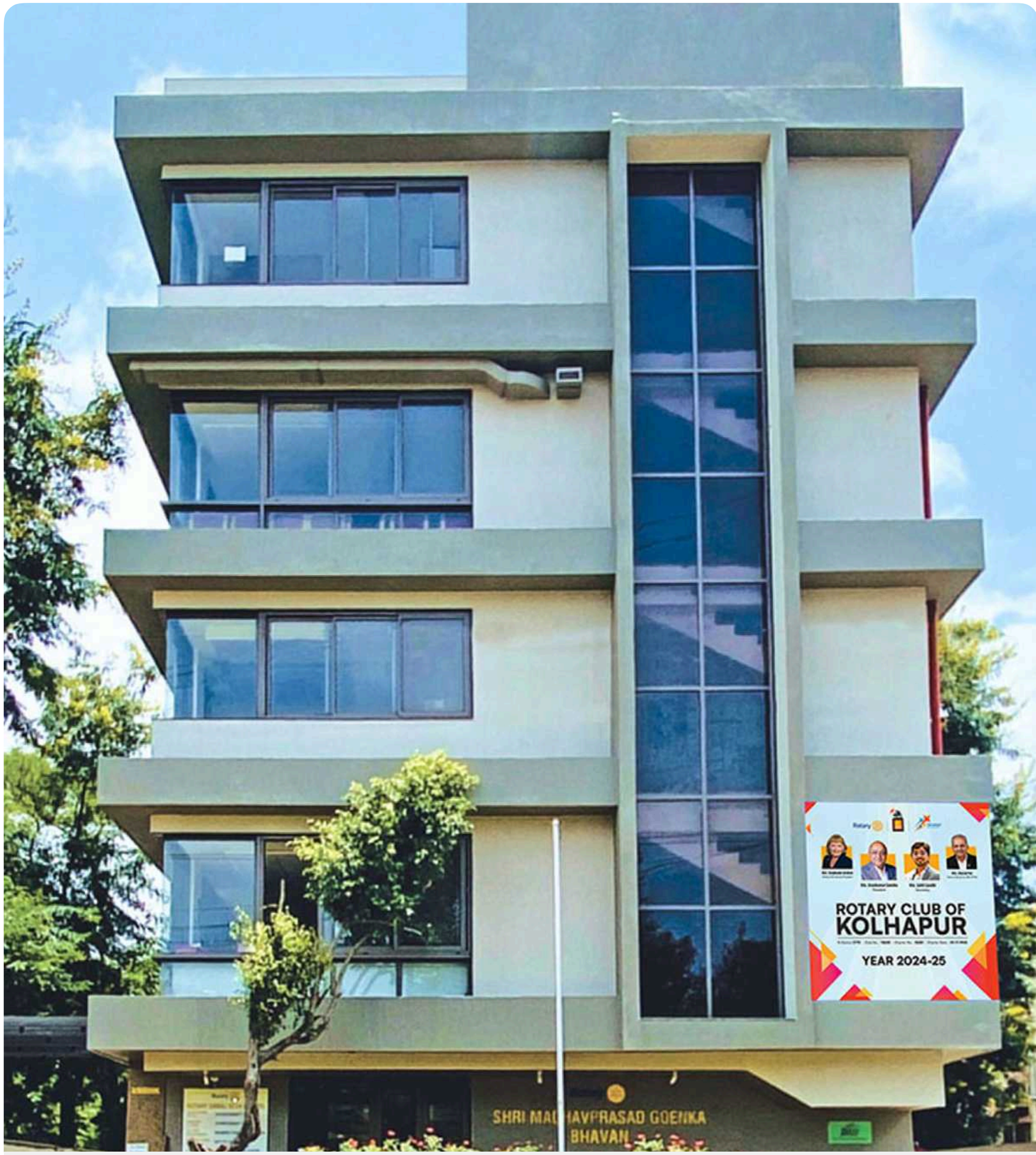
ROTARY CLUB OF KOLHAPUR'S ROTARY SAMAJ SEVA KENDRA BUILDING